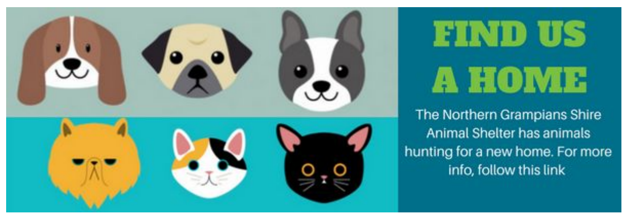
Figure 4 NGSC staff email footer promoting adoption of impounded animals.

Council Officers facilitate adoption directly from the Council Pound and support 84Y Agreement participants to assist with rehoming animals. Officers promote animals available for adoption through Council's website and social media channels. Council initiatives including animal rehoming are also promoted in all staff's outgoing emails as a footer advertisement (see example in figure 4 below).