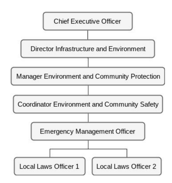
Figure 2 Organisational chart showing Local Laws structure.