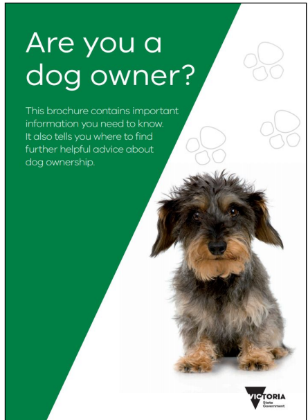
Figure 3 Responsible pet ownership brochures.