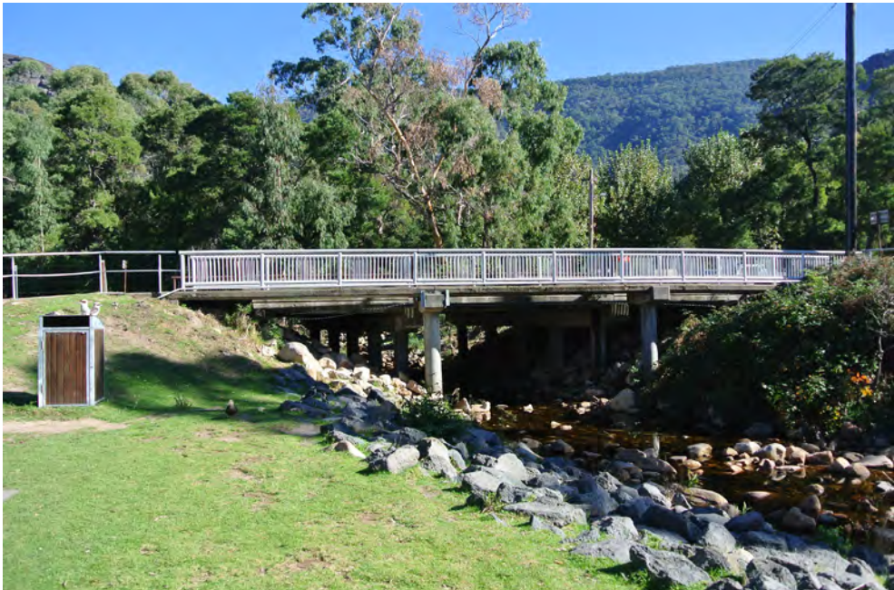
Figure 22. Existing Stoney Creek bridge