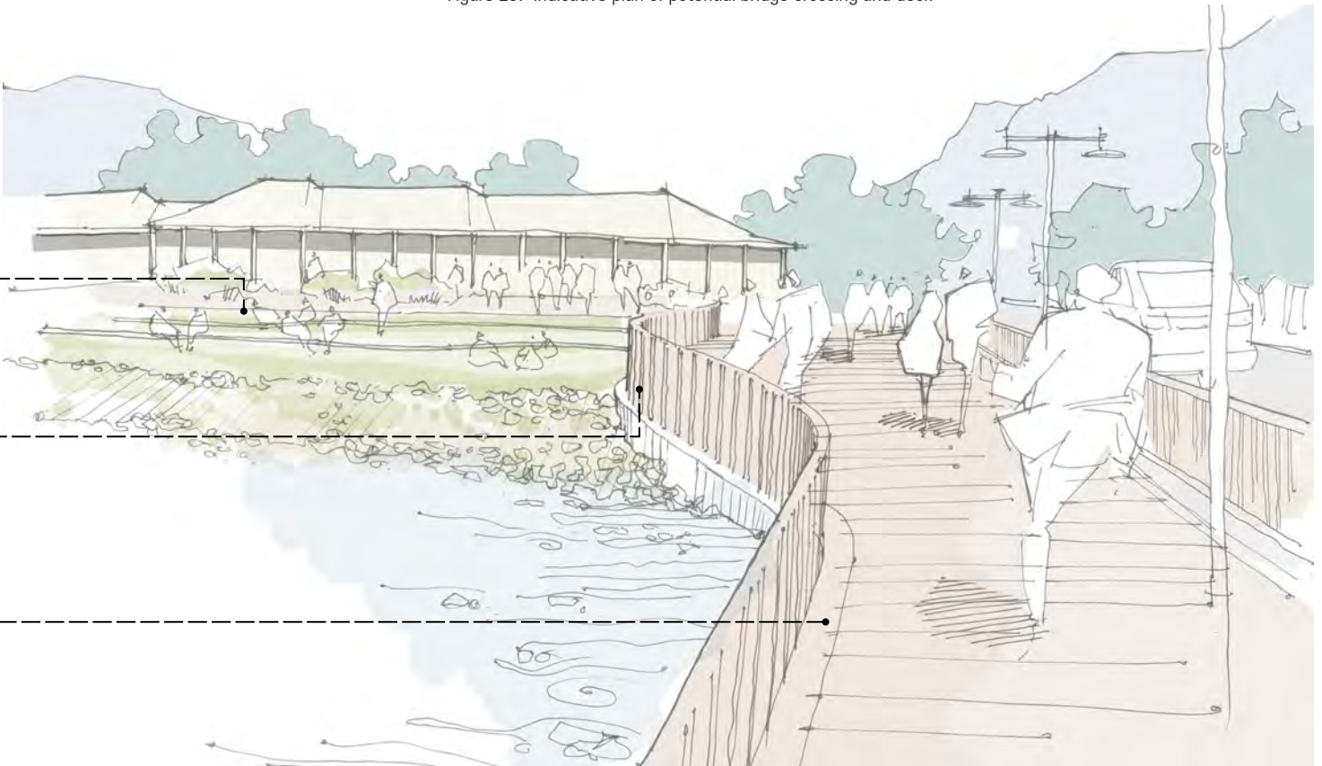
Figure 24. Indicative perspective illustration of potential bridge crossing and deck