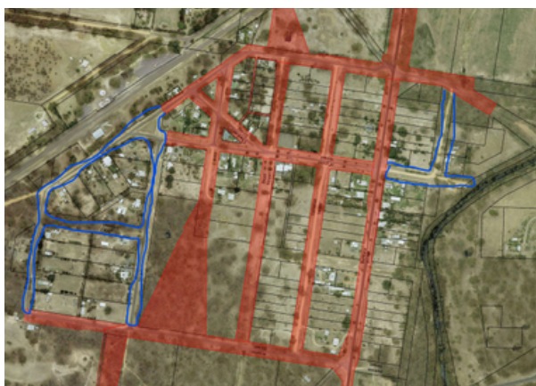
Colored areas shows streets being surveyed

Using the completed designs, projects will be identified and built into the council's capital works program over a number of years.